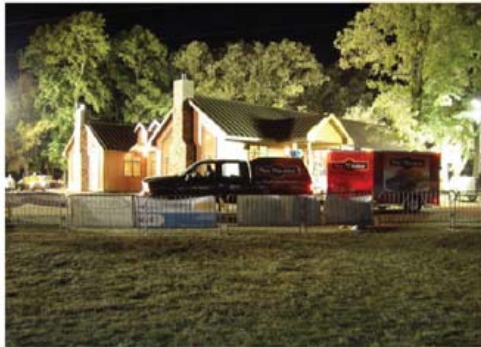
Extreme Makeover Home Edition

Closer to home, many causes in and around St. Michael and Albertville receive annual support. Examples are the St. Michael and Albertville Fire Departments, STMA Business Professionals of America and the high school graduation parties in STMA, Rogers, Monticello, Buffalo and Elk River.